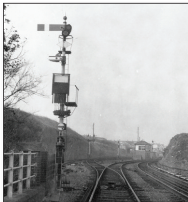
Newquay Down Loop Inner Home Signal October 1965.