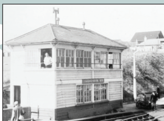
Liskeard Signalbox in the 1960s.