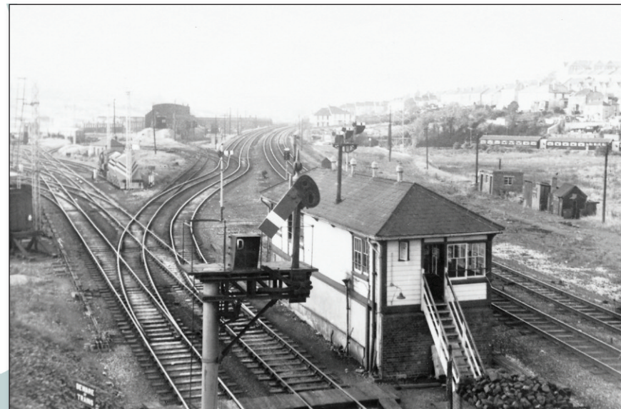
Laira Junction Signalbox in the early 1960s.