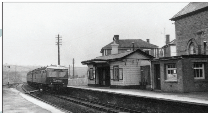
Right: DMU 51586 entering Grampound Road Station on the down in the early 1960s.