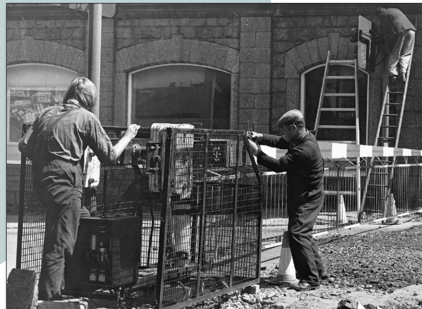
Camborne Level crossing barriers being installed in 1970.