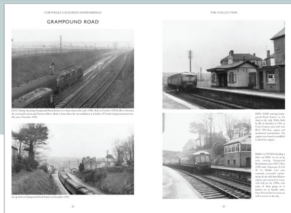
Example of a double-page spread.