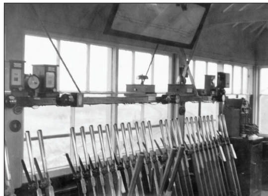
Newquay Signalbox lever-frame in October 1965.